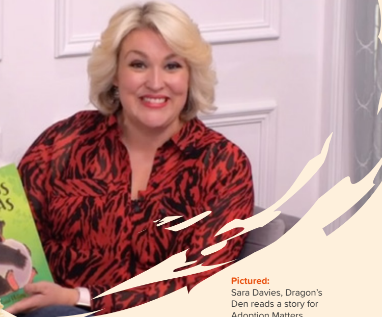
Pictured: Sara Davies, Dragon's Den reads a story for Adoption Matters.